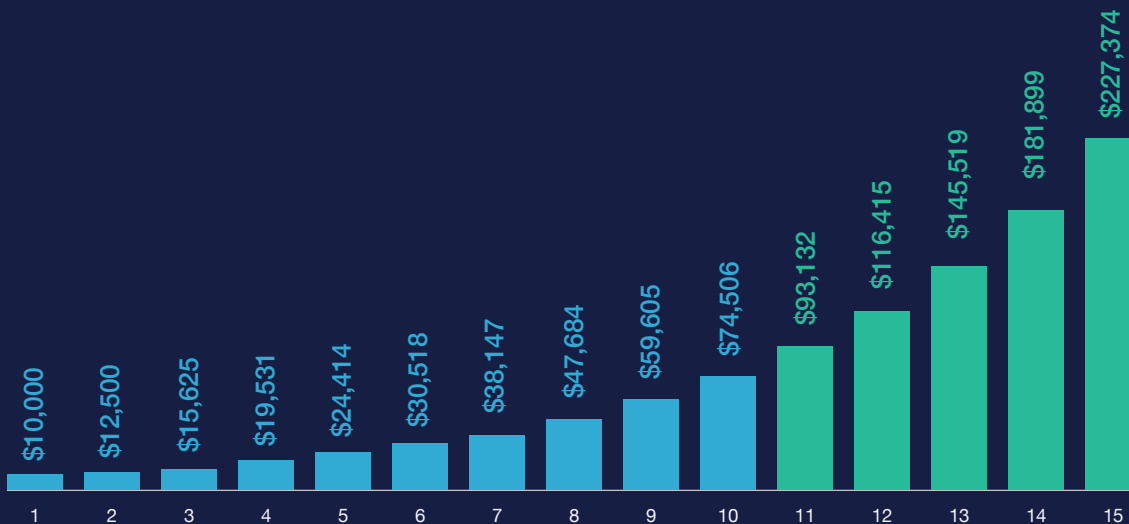
Illustration of contribution levels to take advantage of the 125% opportunity and does not include any projection returns.

ChildBuilder's regular savings plan feature lets you build your tax-effective investment quickly to meet your investment goal. You can automatically increase your additional contributions each year by up to 25% of the previous year's contributions without impacting your ChildBuilder's valuable tax status.