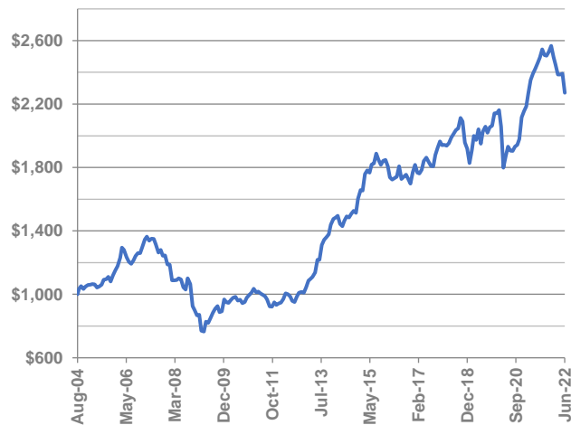
Growth of $1,000 since inception